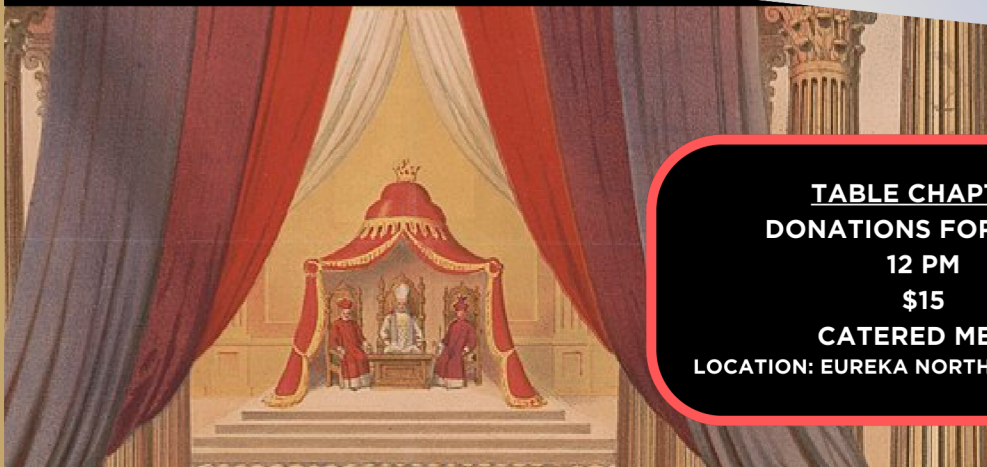
TABLE CHAPTER DONATIONS FOR RARA