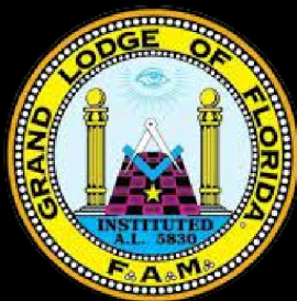
FLORIDA LODGE OF RESEARCH NO. 999